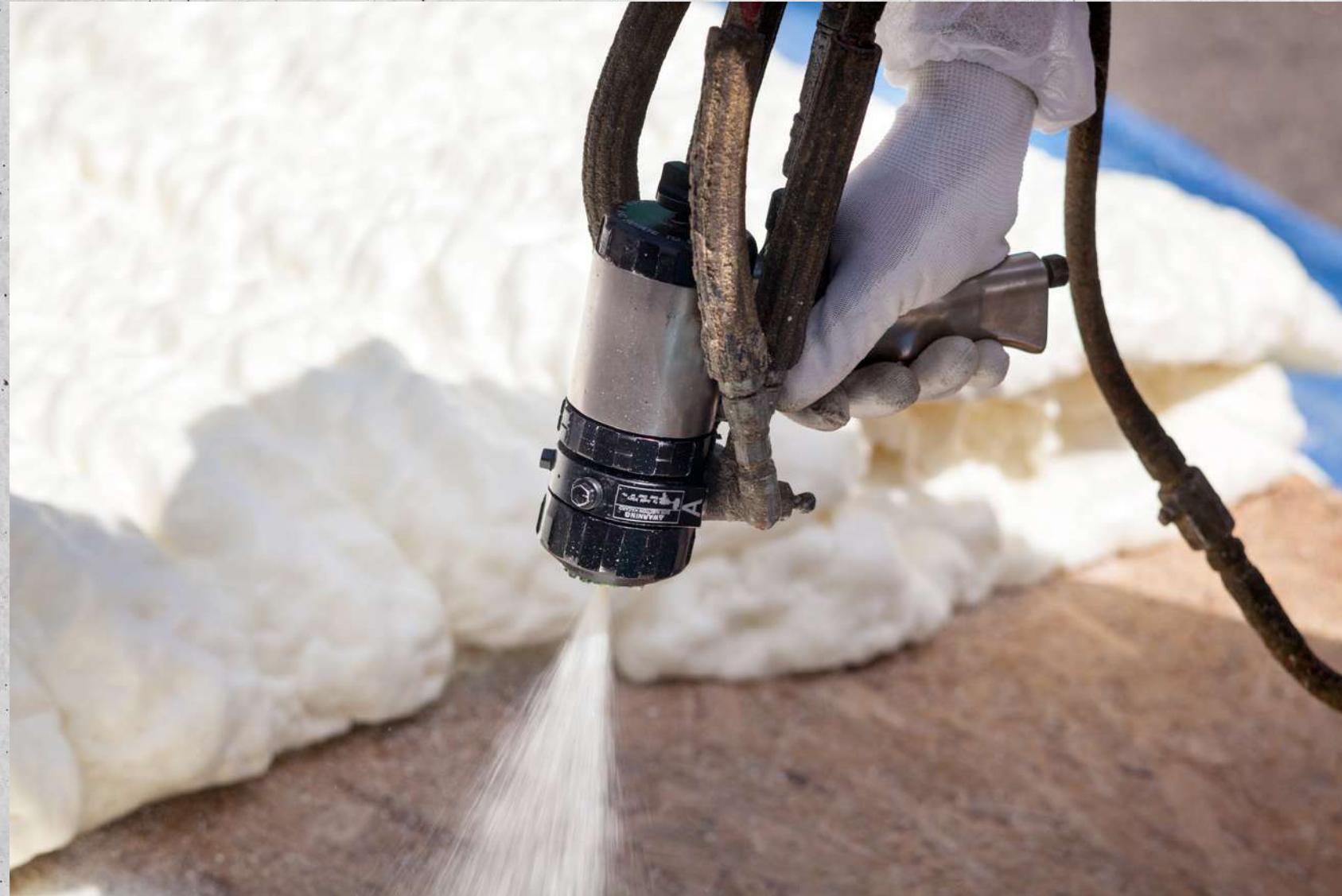
Spray PUF for Heat Insulation