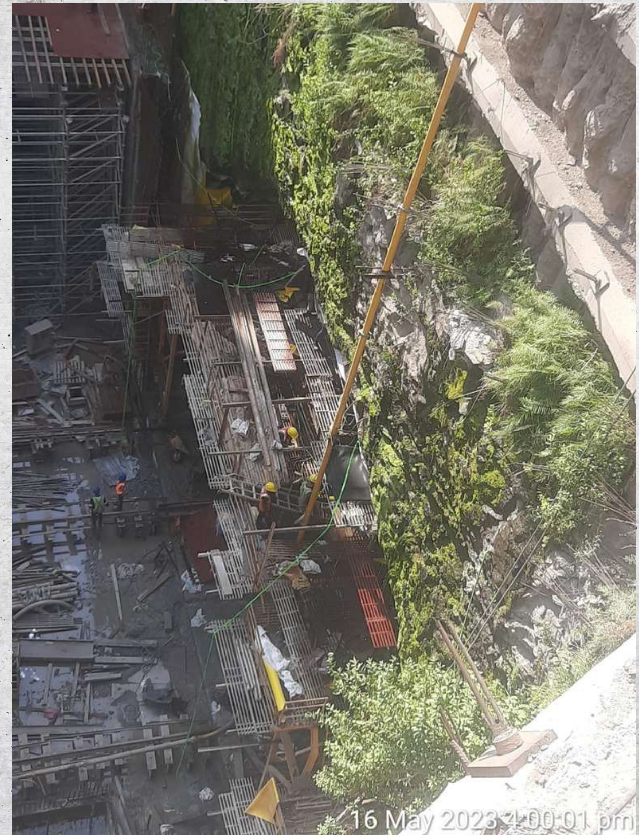
Deep Structure Waterproofing