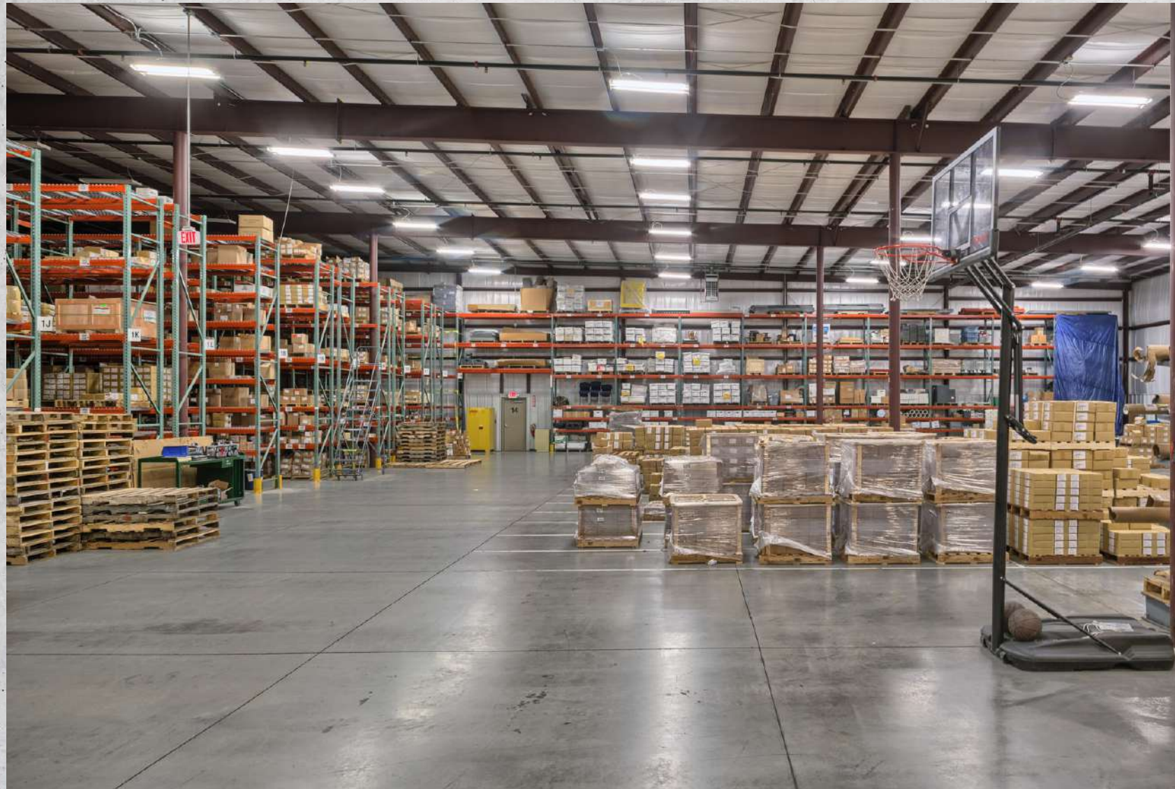
FM2, High Flat Floor for Warehousing