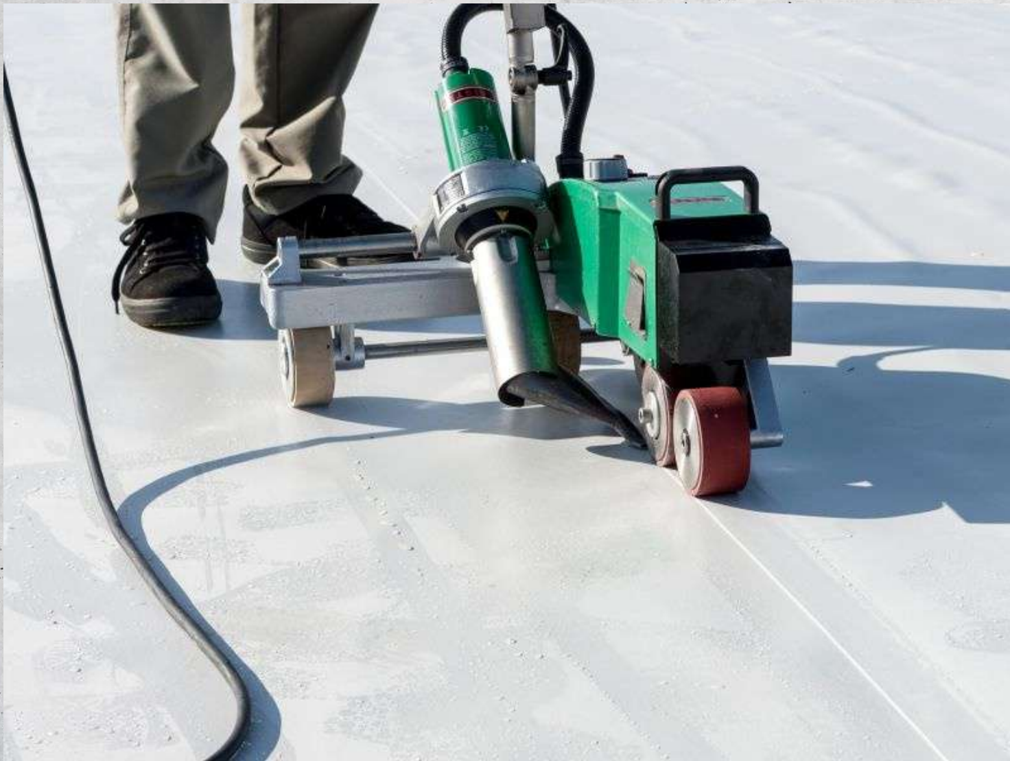
TPO / PVC Installation