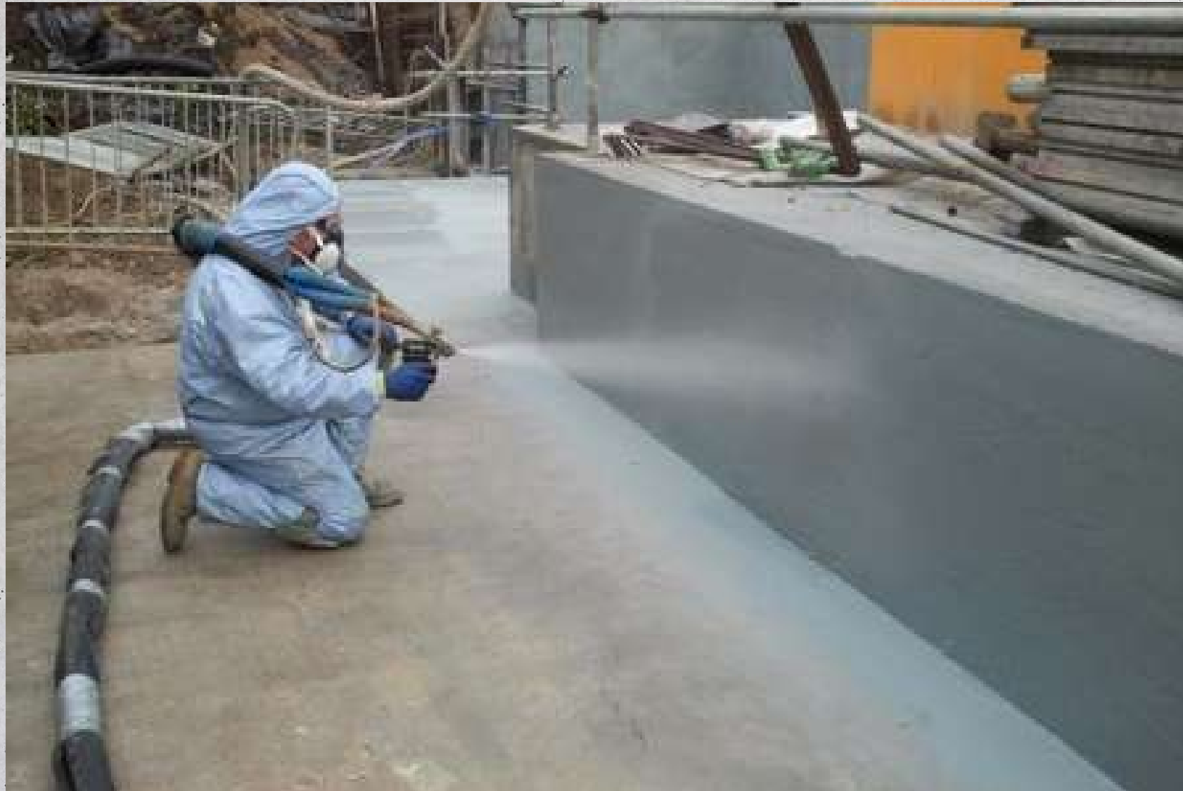
Spray PU Systems